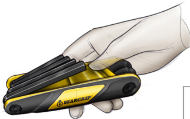
TOOLS FOR BEARGRIP